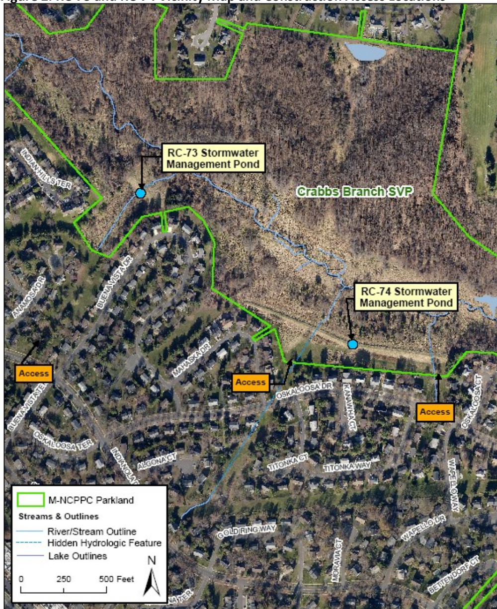
Figure 2. RC-73 and RC-74 Vicinity Map and Construction Access Locations